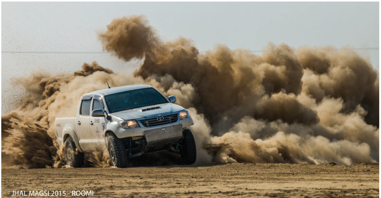
JHAL MAGSI 2015 - ROOMI