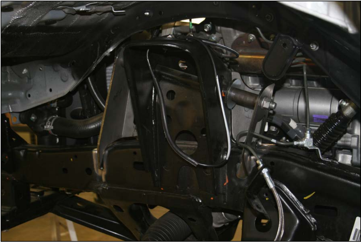
(2-1) Gussets mocked up and ready to be welded. Note: Use inner sleeve and inside washer for coil bucket spacing