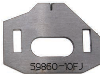
REAR PIVOT CAM TAB (SMALLER HOLE)