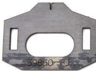
FRONT PIVOT CAM TAB (LARGER HOLE)

ON MOST TOTAL CHAOS CAM TAB GUSSETS, ALL FOUR FRONT PIVOT PLATES WILL HAVE A LARGER OVAL FOR THE ECCENTRIC BOLT. THE REAR PIVOT PLATES WILL HAVE A SMALLER OVAL.*